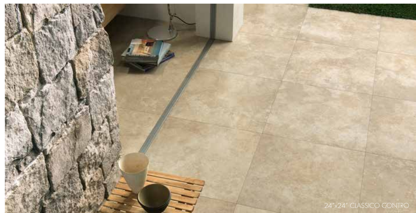
24"x24" CLASSICO CONTRO